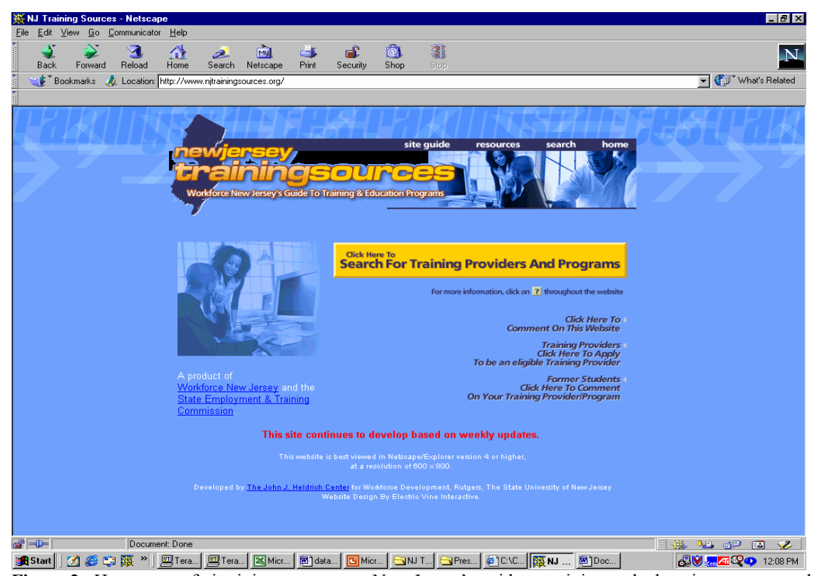
Figure 2 : Homepage of njtrainingsources.org, New Jersey's guide to training and education programs, developed by the Heldrich Center for Workforce Development. The Heldrich Center can provide customized assistance to other states seeking to develop a similar web-based customer-reporting system.

For example, New Jersey has created an on-line "consumer report card" that allows users to search for training providers by location and type of training, and view performance and customer satisfaction information for each training provider (some functions are under development). (See Figure 2).